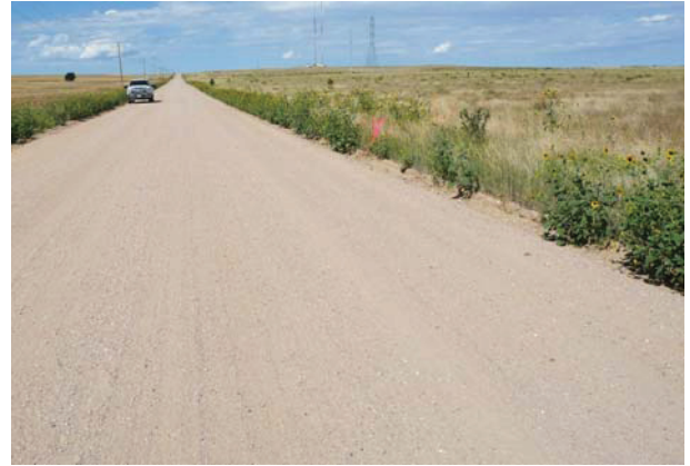
PROPOSED ACCESS AT TAKE-OFF AT COUNTY ROAD 90 LOOKING WEST