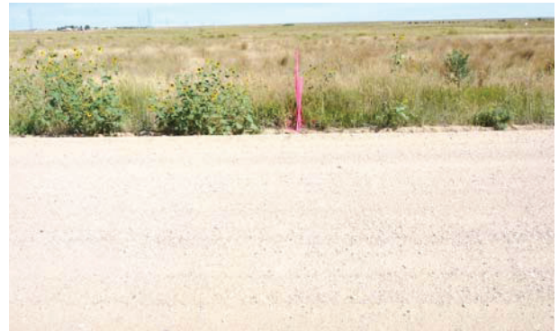
PROPOSED ACCESS AT PAD LOOKING NORTH