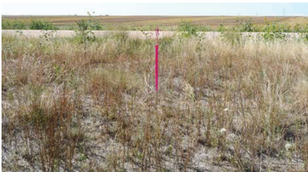
PROPOSED ACCESS AT PAD LOOKING SOUTH