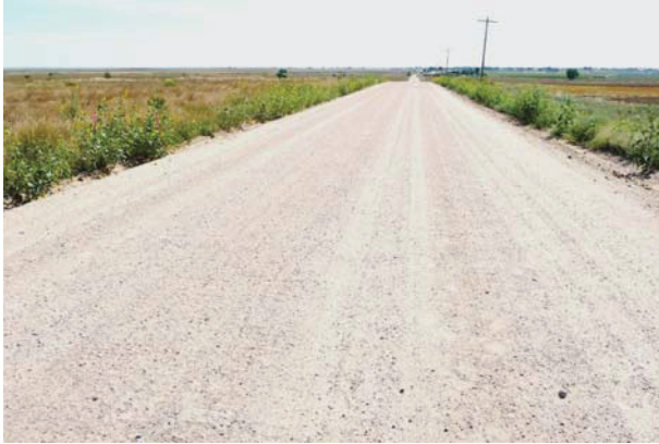
PROPOSED ACCESS AT TAKE-OFF AT COUNTY ROAD 90 LOOKING EAST