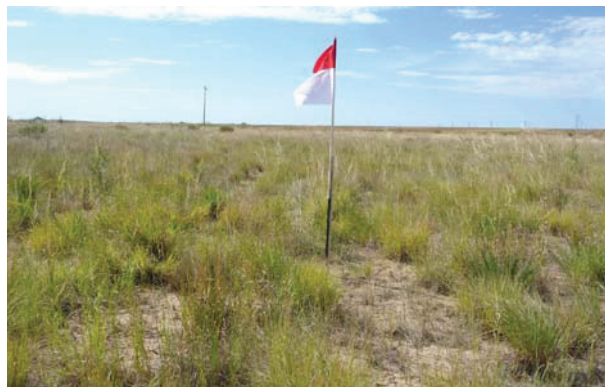
WELL LOCATION LOOKING SOUTH