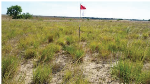
WELL LOCATION LOOKING EAST