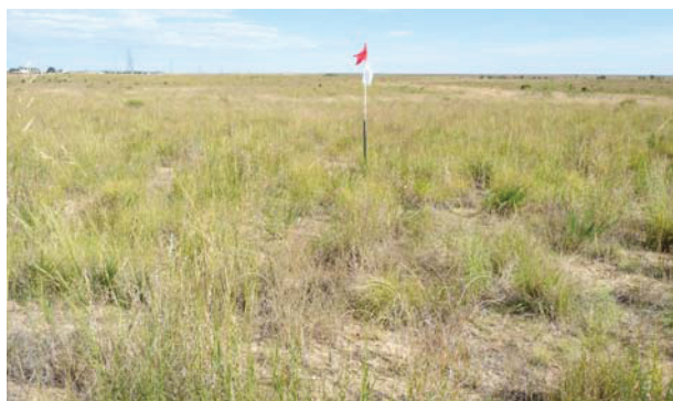
WELL LOCATION LOOKING NORTH