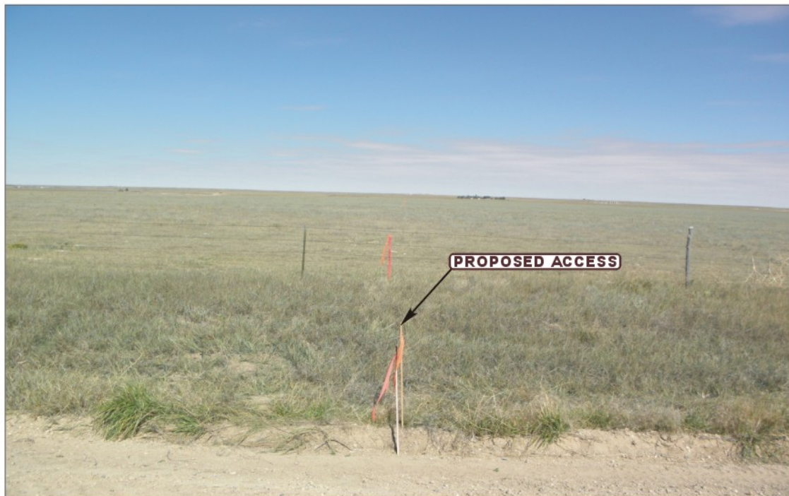
PHOTO: VIEW FROM BEGINNING OF PROPOSED ACCESS