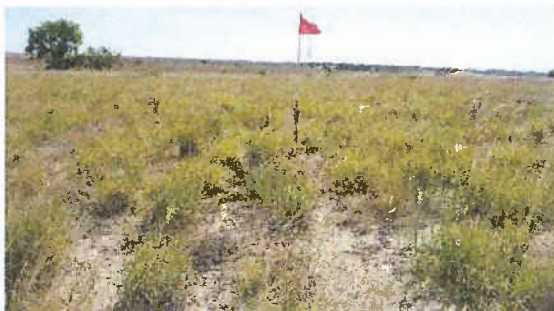
WELL LOCATION LOOKING EAST