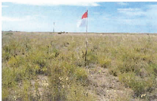
WELL LOCATION LOOKING SOUTH