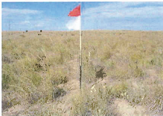
WELL LOCATION LOOKING WEST