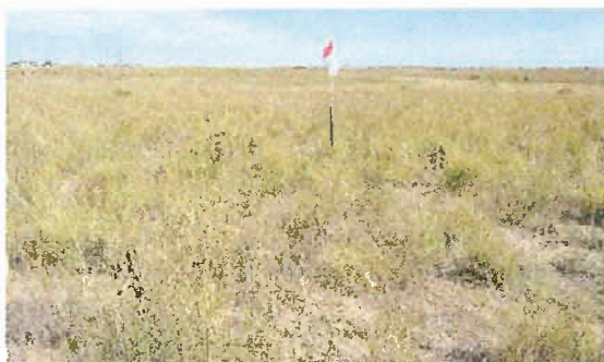
WELL LOCATION LOOKING NORTH