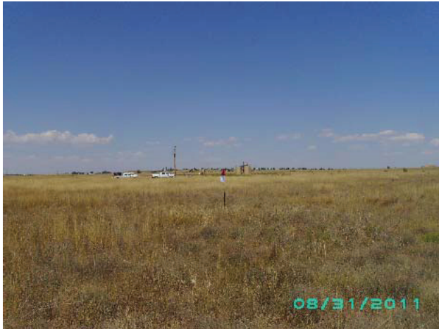
WELL LOCATION LOOKING NORTH