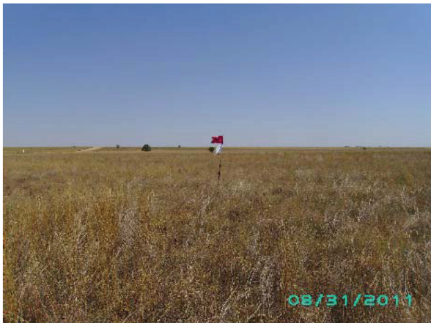
WELL LOCATION LOOKING EAST