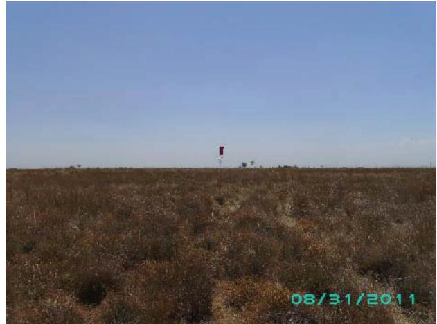
WELL LOCATION LOOKING SOUTH