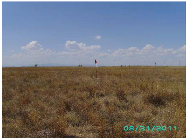
WELL LOCATION LOOKING WEST