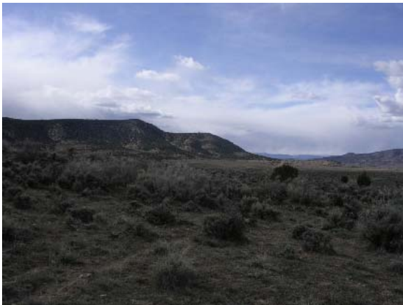
WELL LOCATION LOOKING EAST