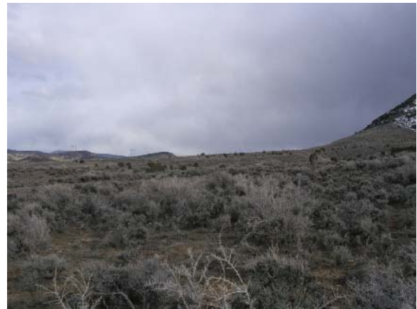
WELL LOCATION LOOKING WEST