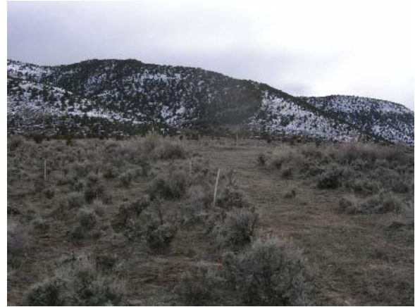
WELL LOCATION LOOKING SOUTH