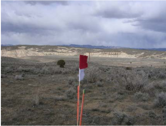
WELL LOCATION LOOKING NORTH