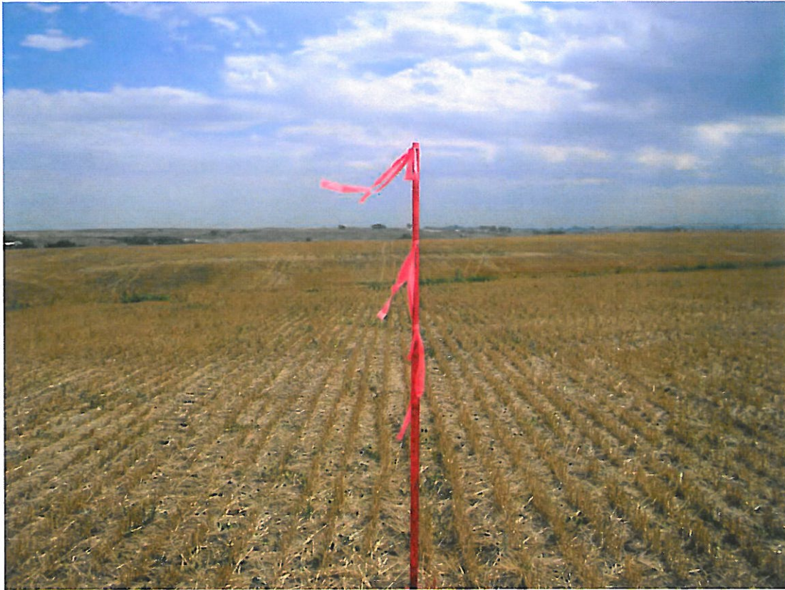
Figure 3: CLETCHER 21-21 LOOKING SOUTH TOWARD TANK BATTERY AREA (NE1/4 NW1/4 SEC 21, T4N, R68W, 8-19-11)