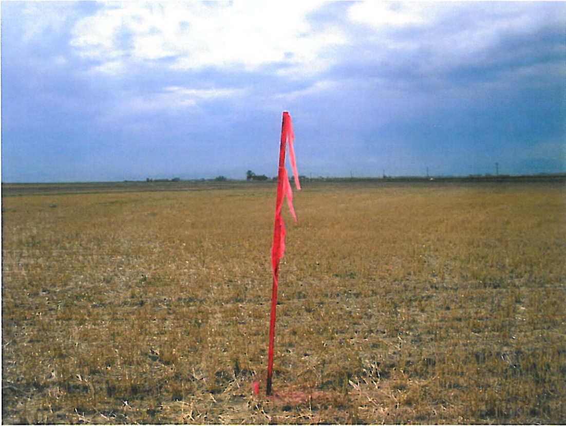
Figure 4: CLETCHER 21-21 LOOKING WEST (NE1/4 NW1/4 SEC 21, T4N, R68W, 8-19-11)