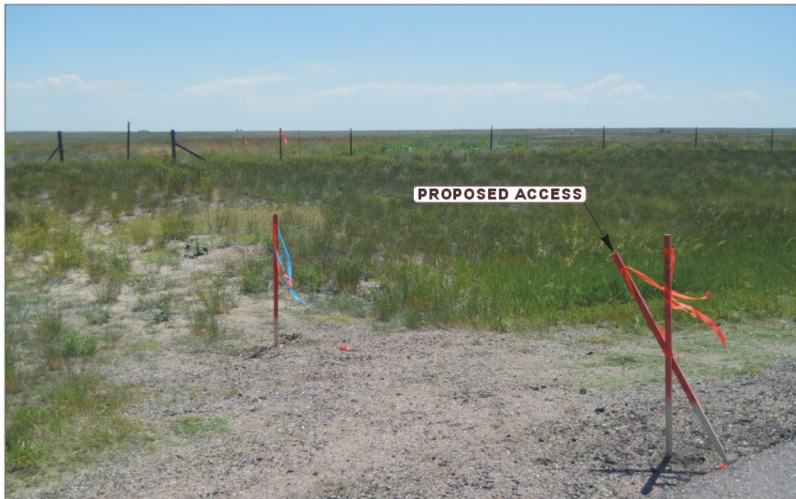
PHOTO: VIEW FROM BEGINNING OF PROPOSED ACCESS