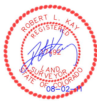
FIGURE #3 SCALE: 1" = 60' DATE: 07-13-11 DRAWN BY: J.I. REV.: 08-02-11