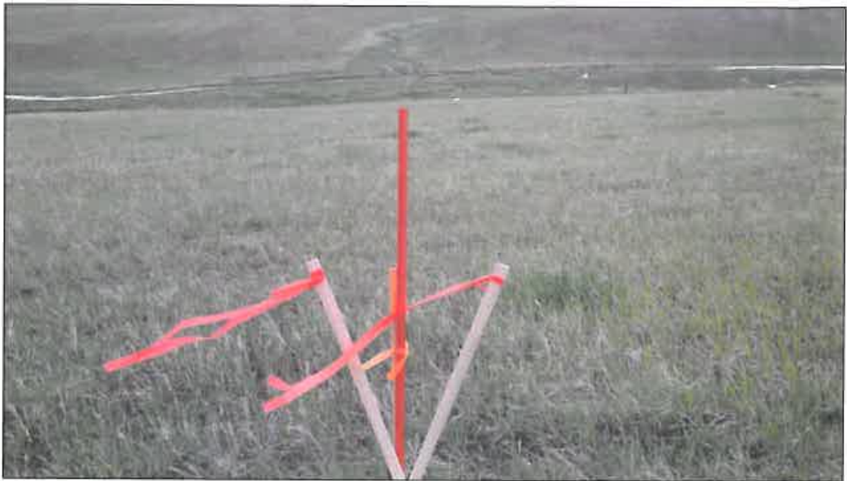
Photo: View from Location Stake to South

BREEZE UNIT #41-22 SECTION 22, T6N, R89W, 6th P.M. 883' FNL 661' FEL