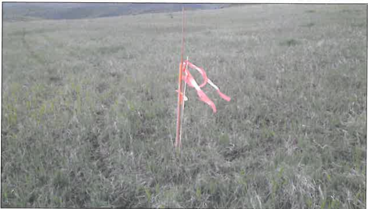
Photo: View from Location Stake to West