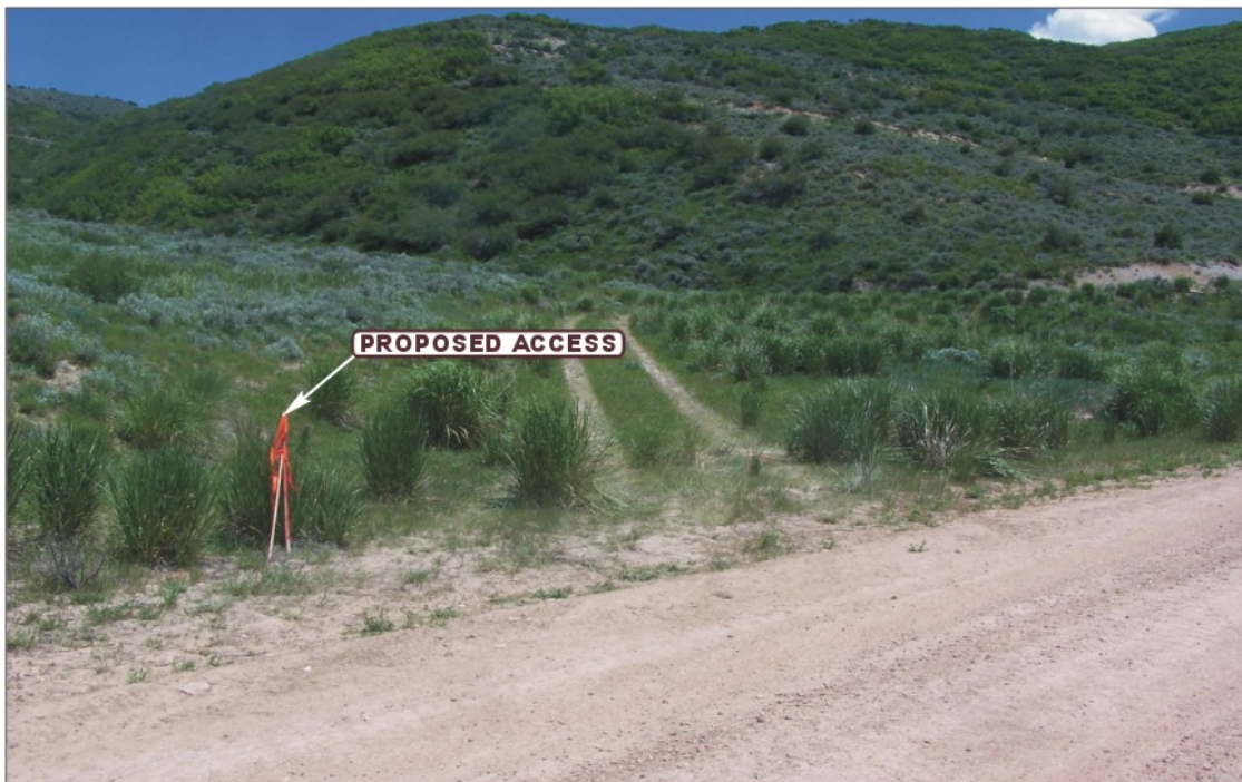
PHOTO: VIEW OF PROPOSED ACCESS