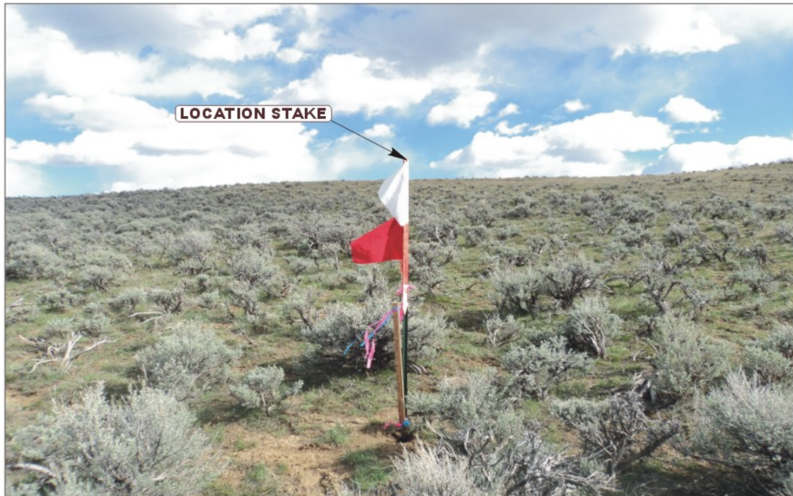
PHOTO: VIEW OF LOCATION STAKE