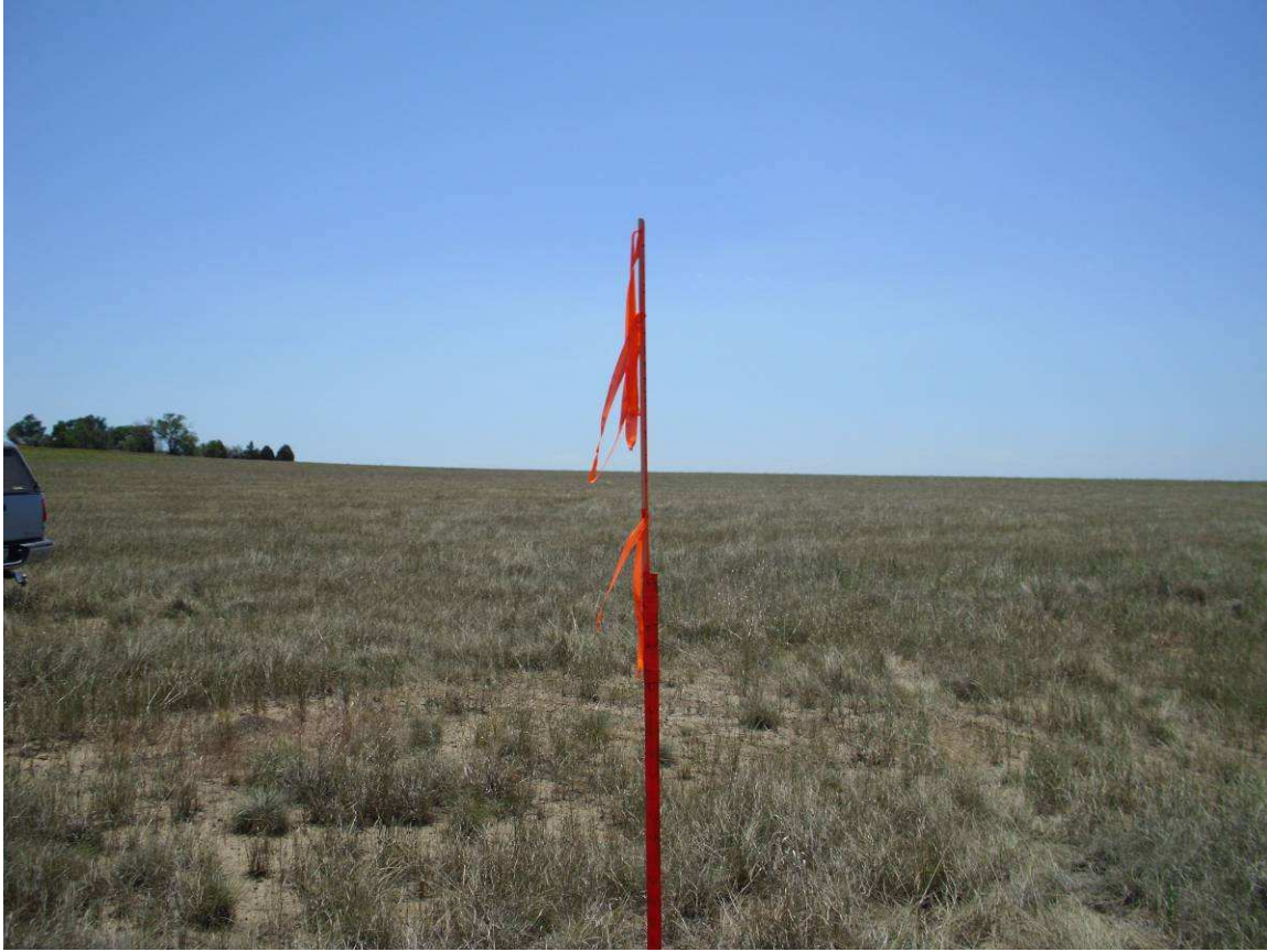
Figure 3: PERRIN 1-10H LOOKING SOUTH (NE1/4 NE1/4 SEC 10, T7N, R62W, 7-8-11)