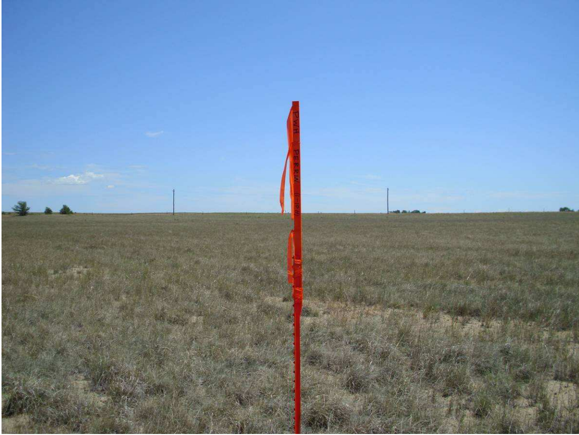
Figure 2: PERRIN 1-10H LOOKING EAST (NE1/4 NE1/4 SEC 10, T7N, R62W, 7-8-11)