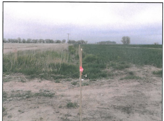
Looking down the roadway to the right of the access

Well Name: Wilson 4-26, 3-26, & Wilson Facility