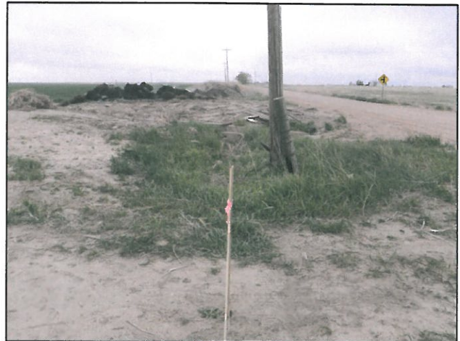
Looking down the roadway to the left of the access