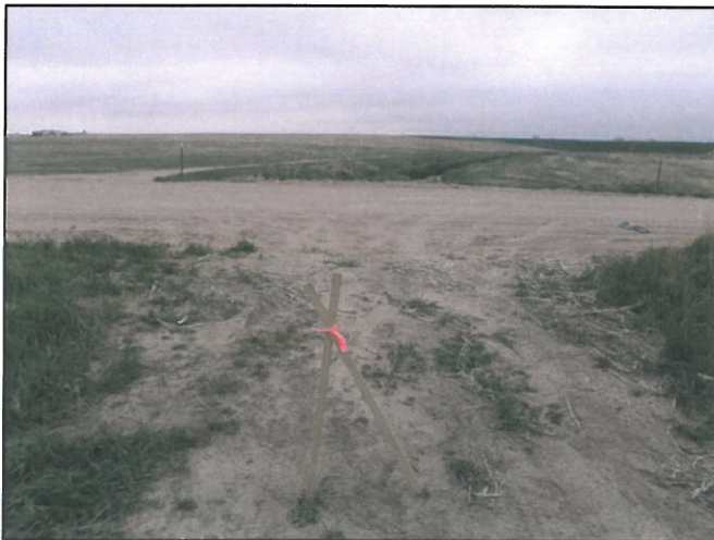
Looking from the access to the roadway