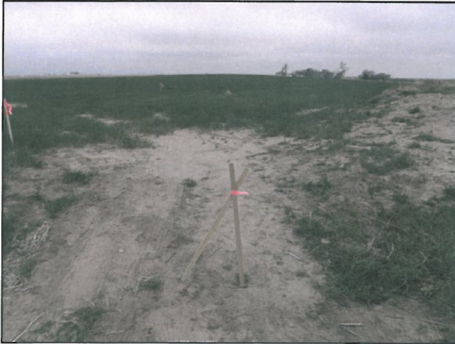
Looking from the roadway into the access location