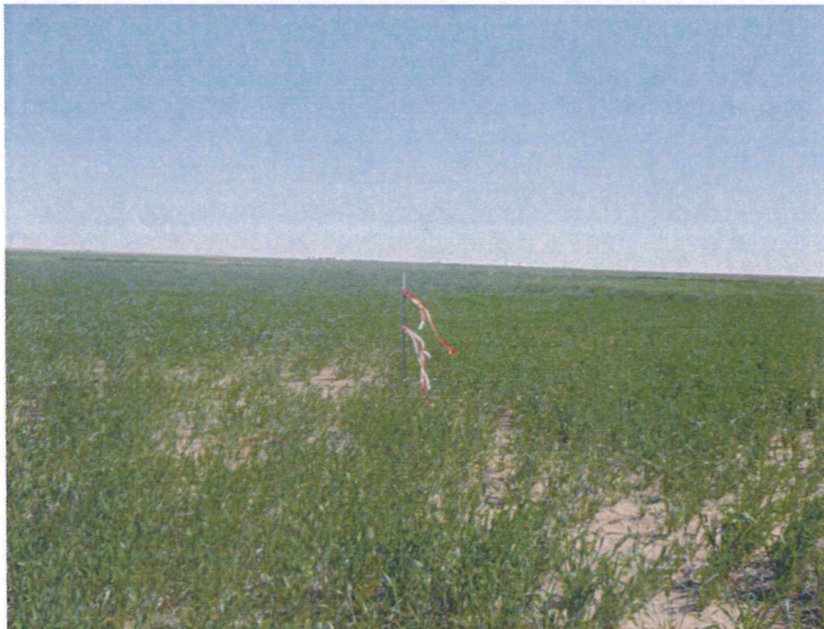
Schlachter 743-6-31 NW ¼ NE ¼ SEC. 6, T7N, R43W Looking North 10 June, 2011