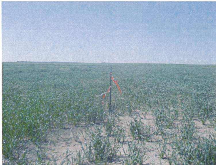
Schlachter 743-6-31 NW ¼ NE ¼ SEC. 6, T7N, R43W Looking South 10 June, 2011