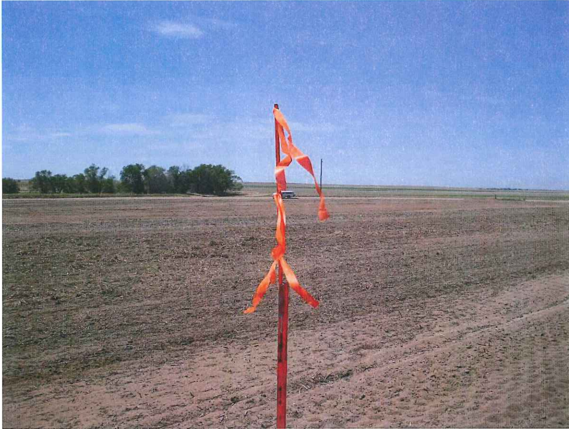
Figure 3: HAHN 1-4H LOOKING SOUTH TOWARD ACCESS AND TANK BATTERY AREA (SE1/4 SE 1/4 SEC 4, T7N, R62W, 7-8-11)