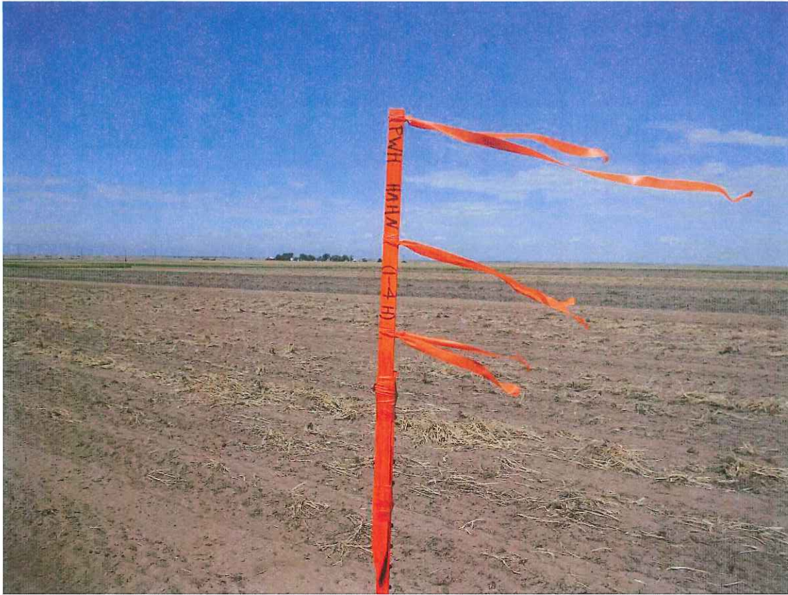
Figure 4: HAHN 1-4H LOOKING WEST (SE1/4 SE 1/4 SEC 4, T7N, R62W, 7-8-11)