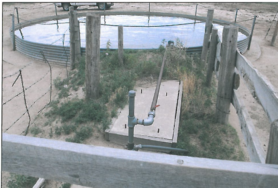
Water Well Looking South

Well Name: Unknown Water Well ( As related to SLICK ROCK 19-44-7-60)