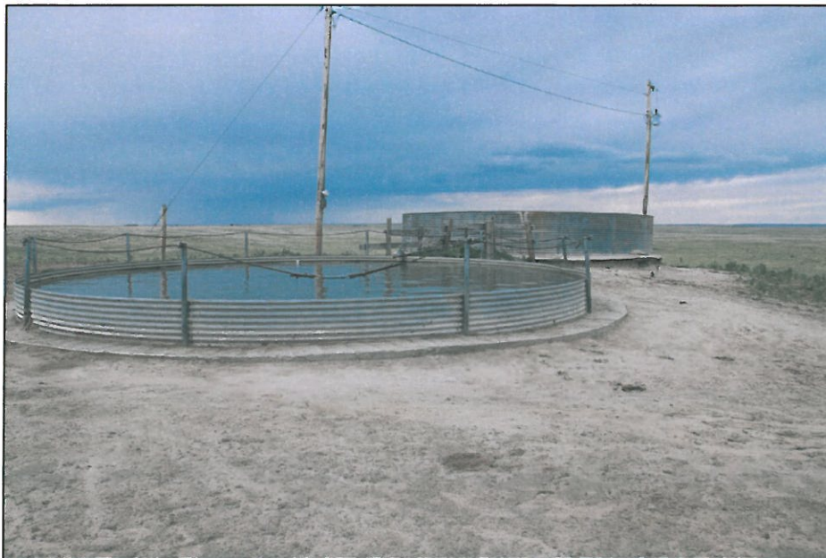
Water Tank Looking North