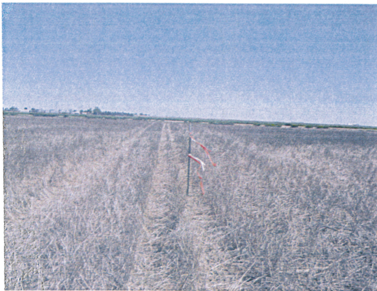
Schlachter 743-6-11 NW ¼ NW ¼ SEC. 6, T7N, R43W Looking North 10 June, 2011