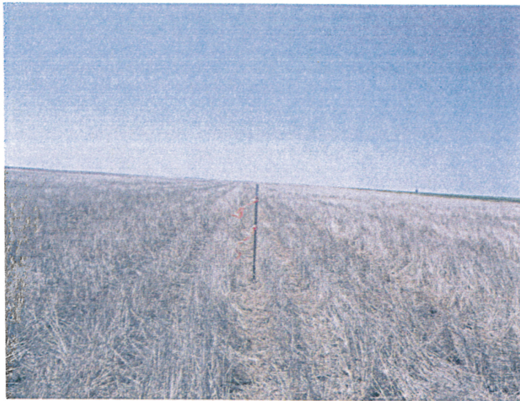
Schlachter 743-6-11 NW ¼ NW ¼ SEC. 6, T7N, R43W Looking South 10 June, 2011