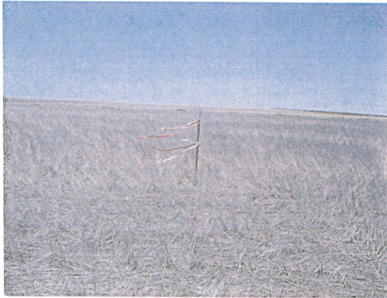
Schlachter 743-6-11 NW ¼ NW ¼ SEC. 6, T7N, R43W Looking West 10 June, 2011