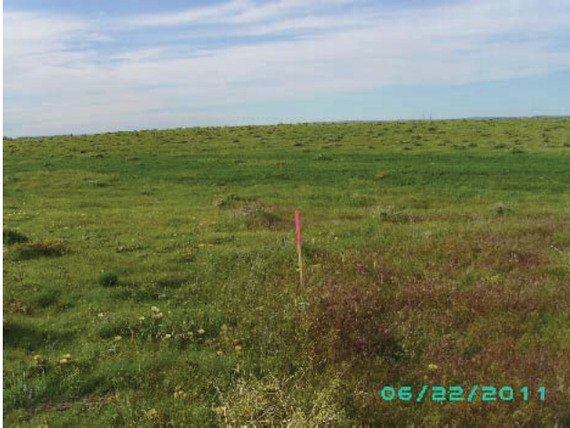
PROPOSED ACCESS AT PAD LOOKING NORTH