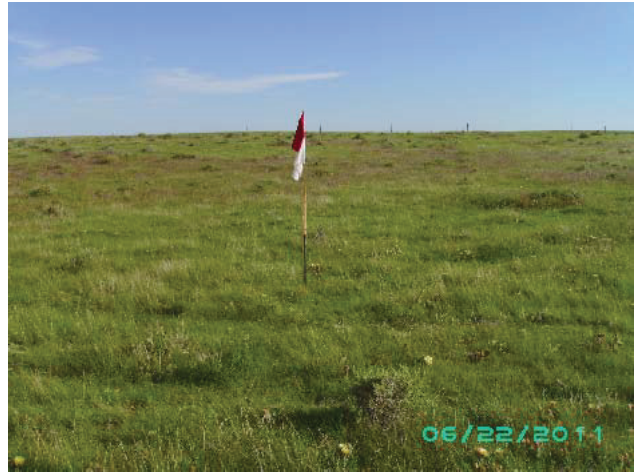
WELL LOCATION LOOKING SOUTH