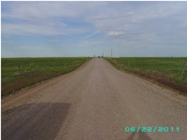
PROPOSED ACCESS CR 110 LOOKING EAST