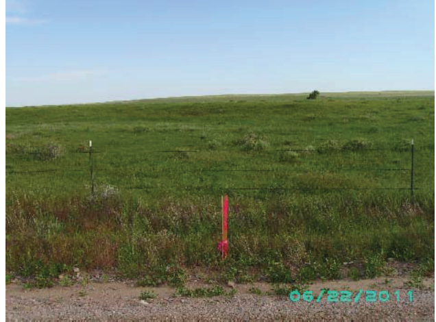
PROPOSED ACCESS CR 110 LOOKING SOUTH