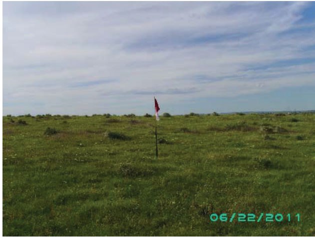
WELL LOCATION LOOKING NORTH