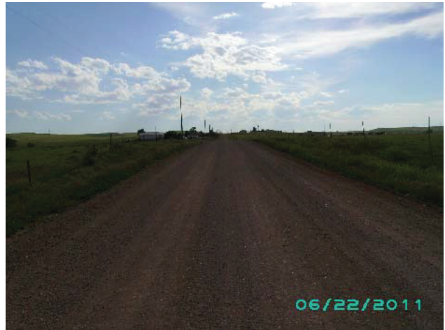
PROPOSED ACCESS CR 110 LOOKING WEST