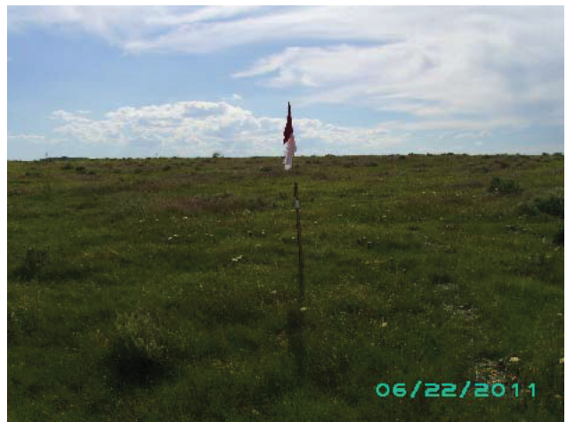
WELL LOCATION LOOKING WEST