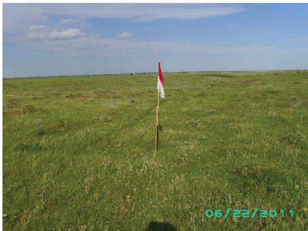
WELL LOCATION LOOKING EAST