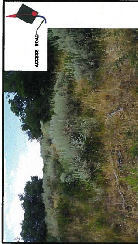
S CORNER OF PAD LOOKING NORTHERLY AUGUST 28, 2007

MARATHON OIL COMPANY PICEANCE BASIN COLORADO