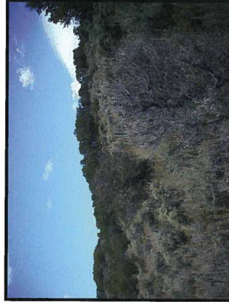
SE CORNER OF PAD LOOKING NORTHWESTERLY SEPTEMBER 22, 2009

MARATHON OIL COMPANY PICEANCE BASIN COLORADO