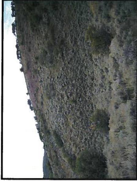
NE CORNER OF PAD LOOKING SOUTHWESTERLY SEPTEMBER 22, 2009