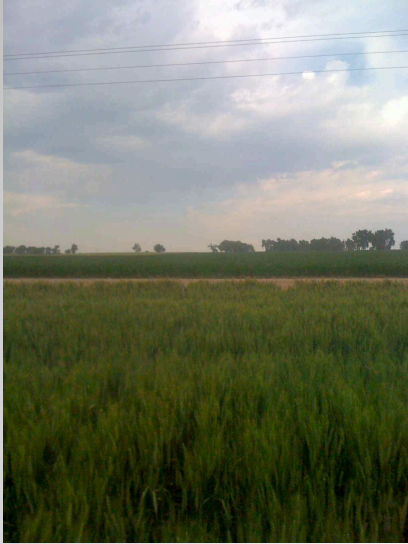
PROPOSED TANK BATTERY • NORTH VIEW

SHL: NE1/4 OF NW-1/4 SECTION 21-T3N-R68W-6 TH PM WELD COUNTY, COLORADO