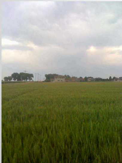
PROPOSED TANK BATTERY • EAST VIEW