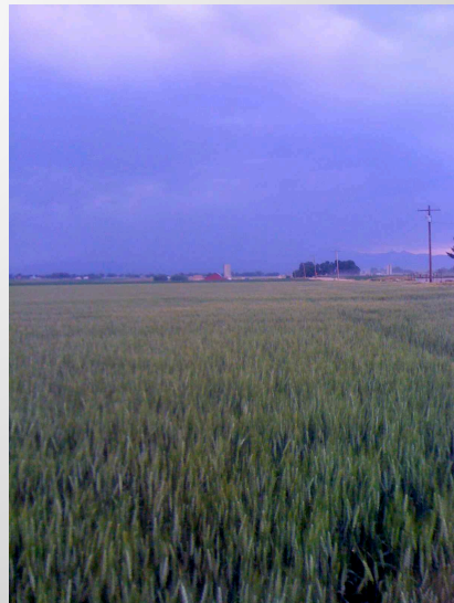
PROPOSED TANK BATTERY • WEST VIEW