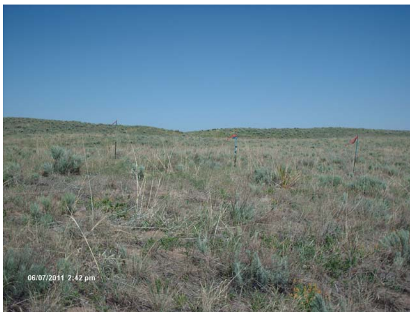
ANTELOPE 11-20 PAD SITE RESTAKE NW 1/4 NW 1/4 SEC. 20 T5N R62W LOOKING EAST JUNE 7, 2011