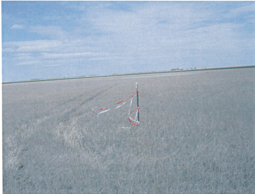
Fulscher 943-15-34 SW \frac{1}{4} SE \frac{1}{4} SEC. 15, T9N, R43W Looking East 20 April, 2011