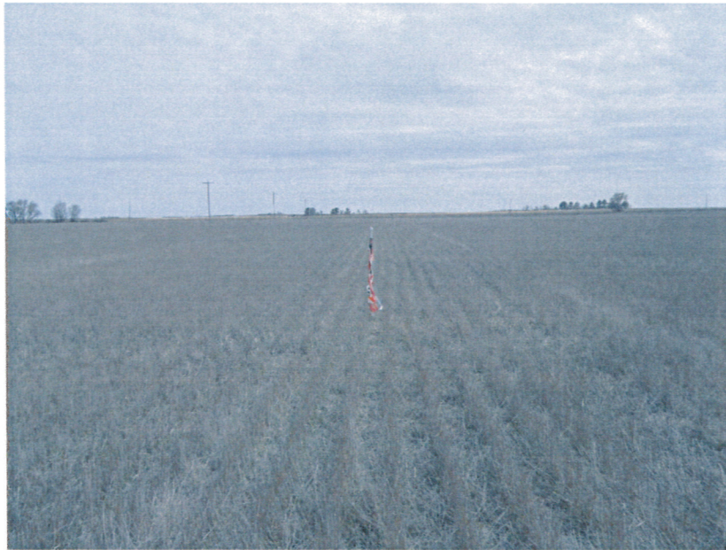
Fulscher 943-15-34 SW ¼ SE ¼ SEC. 15, T9N, R43W Looking South 20 April, 2011