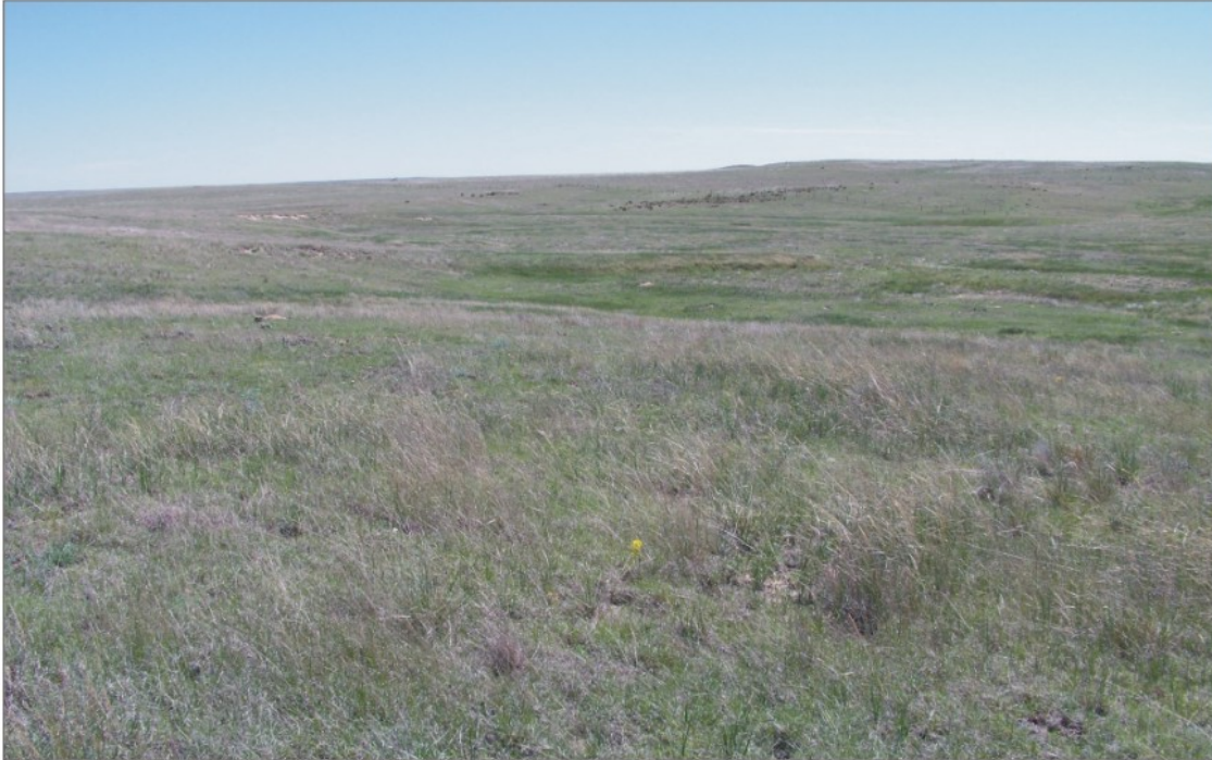
PHOTO: VIEW OF REFERENCE AREA