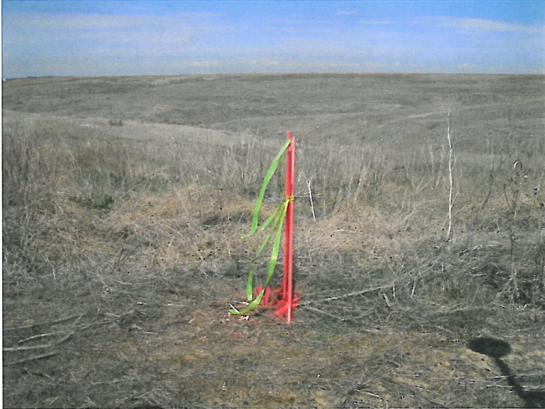
Figure 1: MARGIL TANK BATTERY REFERENCE POINT LOOKING NORTH (NW1/4 NW1/4 SEC 34, T4N, R68W, 4-20-11)