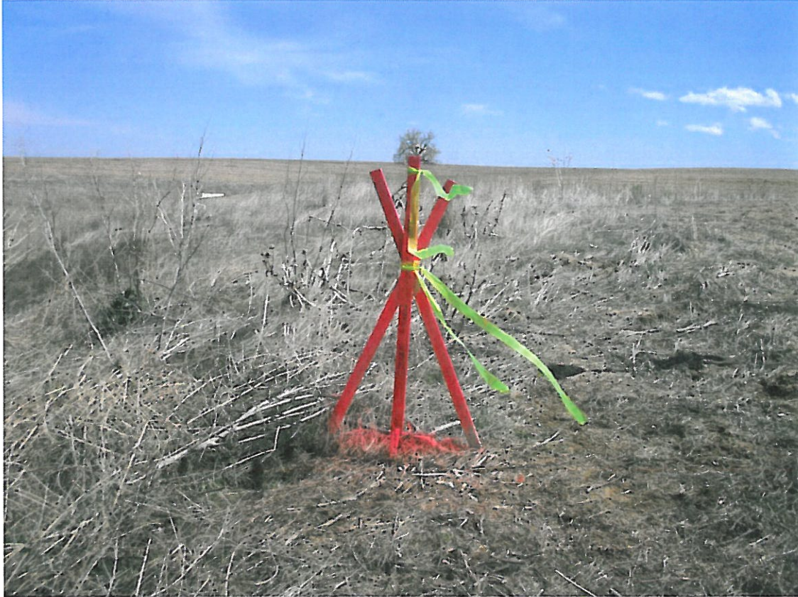
Figure 2: MARGIL TANK BATTERY REFERENCE POINT LOOKING EAST (NW1/4 NW1/4 SEC 34, T4N, R68W, 4-20-11)