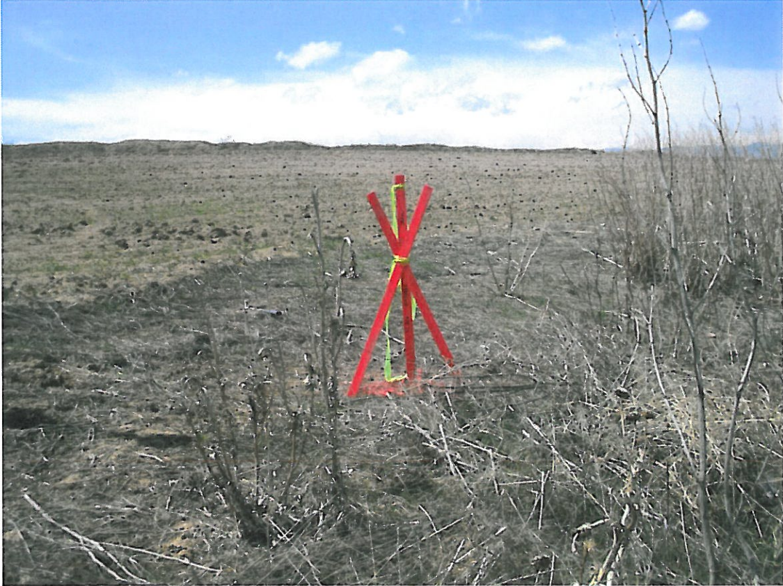
Figure 4: MARGIL TANK BATTERY REFERENCE POINT LOOKING WEST TOWARD ACCESS ROAD (NW1/4 NW1/4 SEC 34, T4N, R68W, 4-20-11)