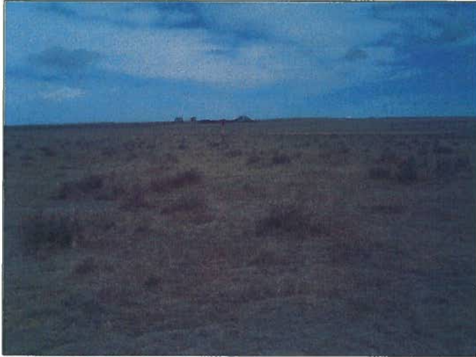
OWL CREEK 8-64-30-1A North.jpg