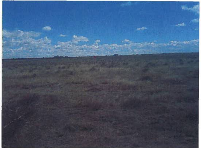
OWL CREEK 8-64-30-1A East.jpg