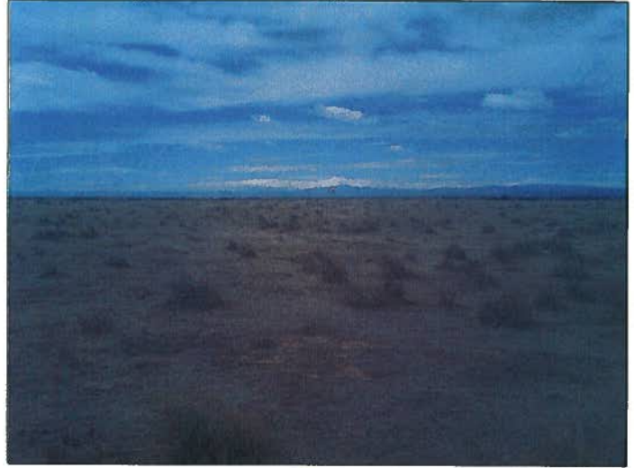
OWL CREEK 8-64-30-1A West.jpg