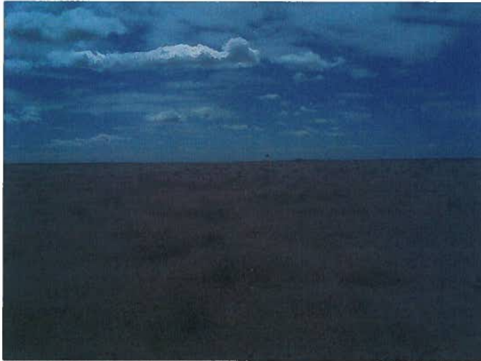
OWL CREEK 8-64-30-1A South.jpg