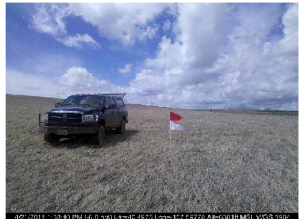
WELL LOCATION LOOKING WEST