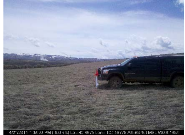
WELL LOCATION LOOKING SOUTH