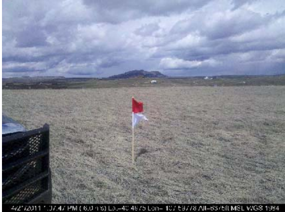
WELL LOCATION LOOKING NORTH