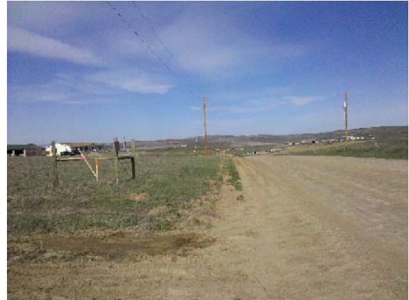
PROPOSED ACCESS AT TAKE-OFF