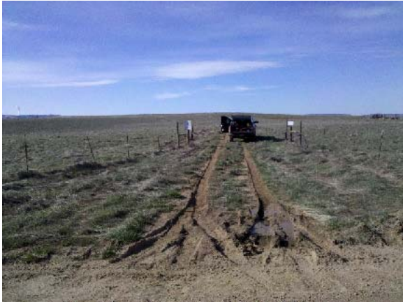
PROPOSED ACCESS AT PAD