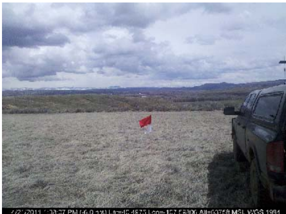
WELL LOCATION LOOKING EAST