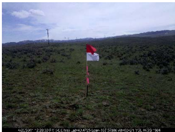
WELL LOCATION LOOKING EAST