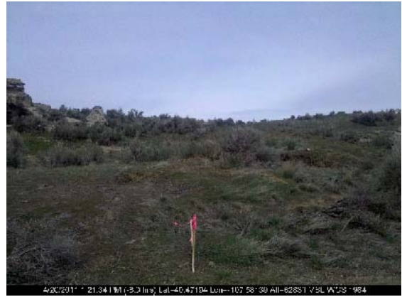
PROPOSED ACCESS AT TAKE-OFF