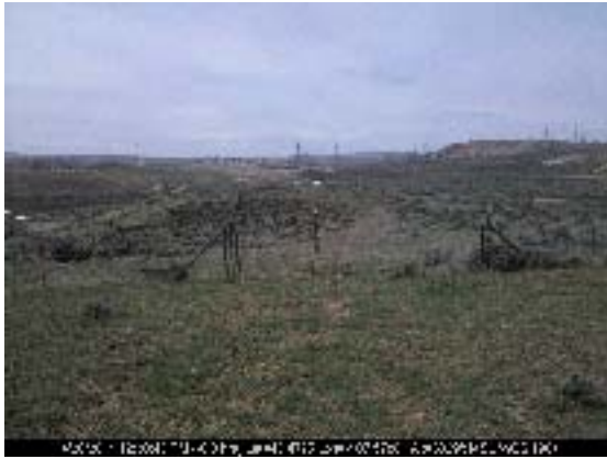
PROPOSED ACCESS AT PAD