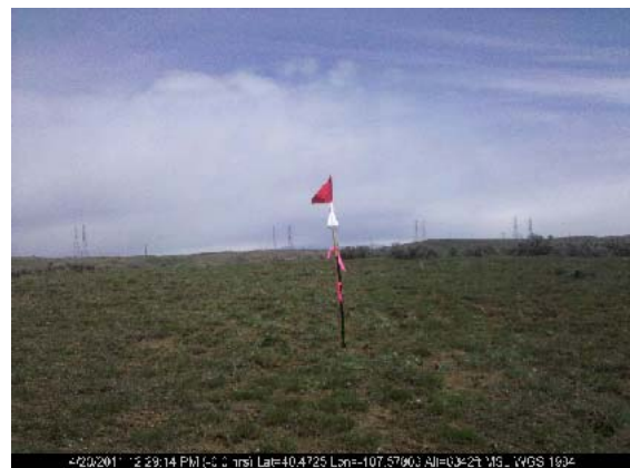
WELL LOCATION LOOKING WEST