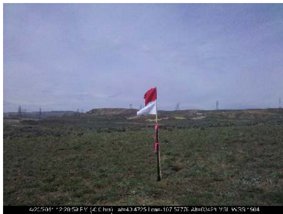
WELL LOCATION LOOKING NORTH