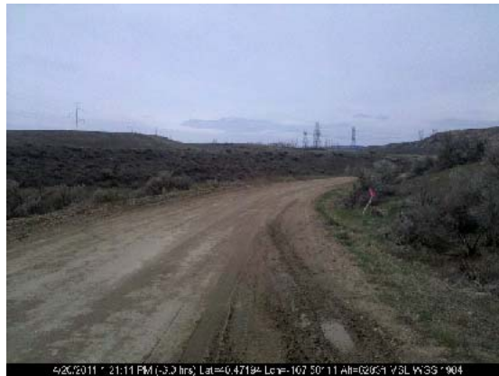
EXISTING ROAD AT TAKE-OFF