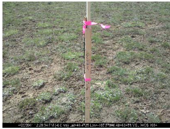
WELL LOCATION CENTER STAKE