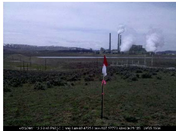
WELL LOCATION LOOKING SOUTH