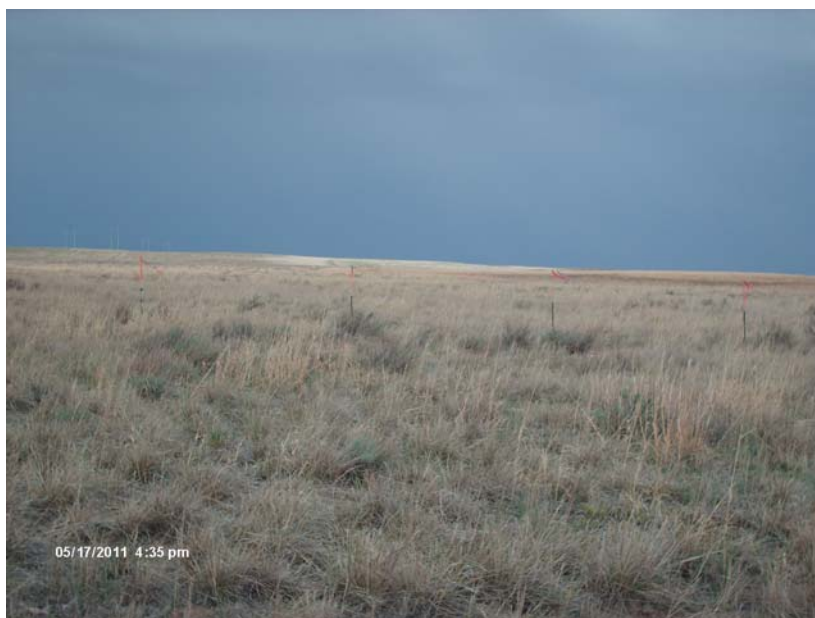
ANTELOPE 41-17 NE 1/4 NE 1/4 SEC. 17 T5N R62W LOOKING EAST MAY 17, 2011