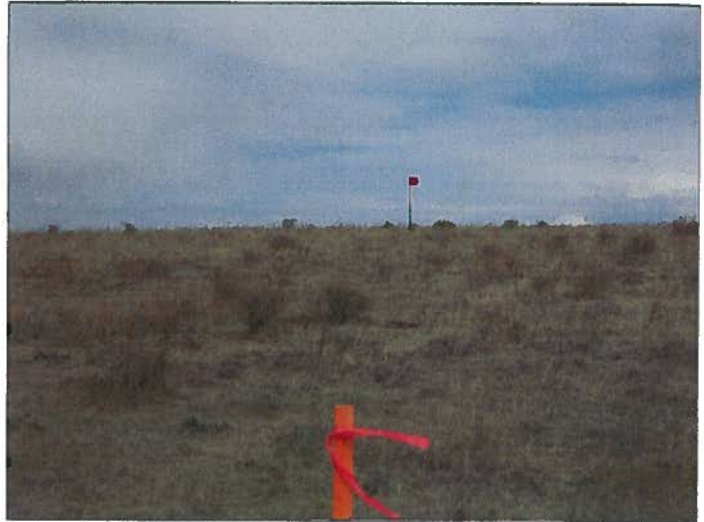
PAWNEE CREEK 9-57-18-1B East.jpg 04/19/2011