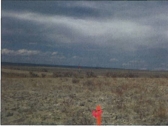
PAWNEE CREEK 9-57-18-1B North.jpg 04/19/2011