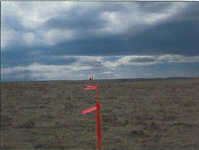
PAWNEE CREEK 9-57-18-1B West.jpg 04/19/2011