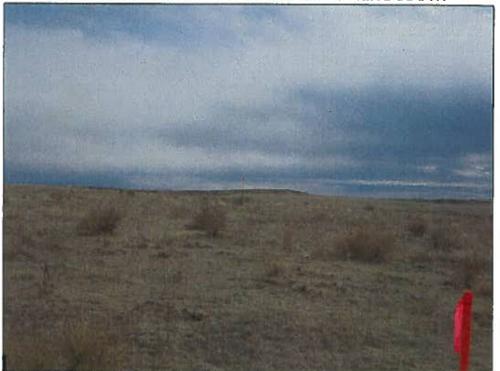
PAWNEE CREEK 9-57-18-1B South.jpg 04/19/2011