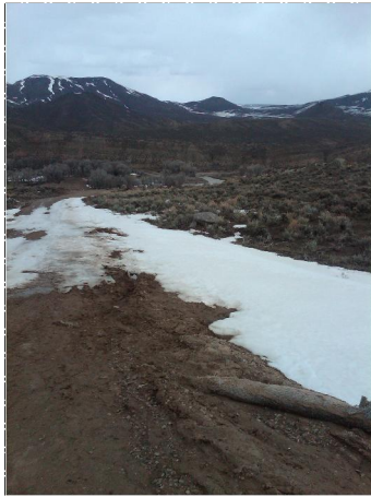
REFERENCE LOOKING NORTH (#1)