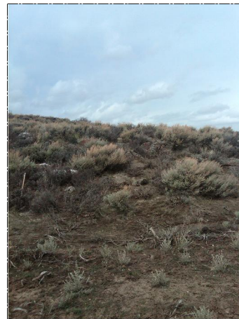
REFERENCE LOOKING WEST (#4)