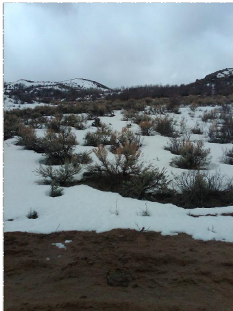
REFERENCE LOOKING SOUTH (#3)