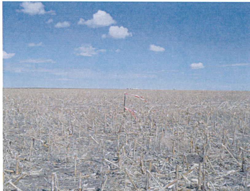
Claymon 843-6-21-L6 NE ¼ NW ¼ SEC. 6, T8N, R43W Looking North 30 March, 2011