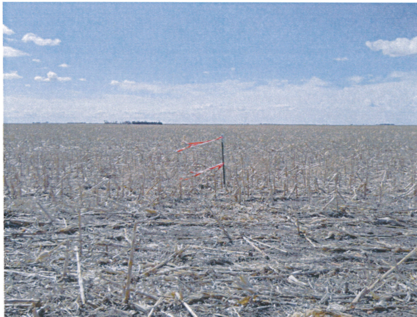
Claymon 843-6-21-L6 NE ¼ NW ¼ SEC. 6, T8N, R43W Looking South 30 March, 2011