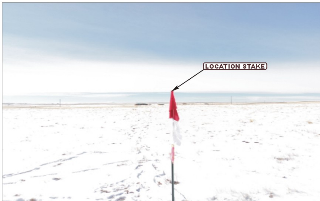
PHOTO: VIEW OF LOCATION STAKE