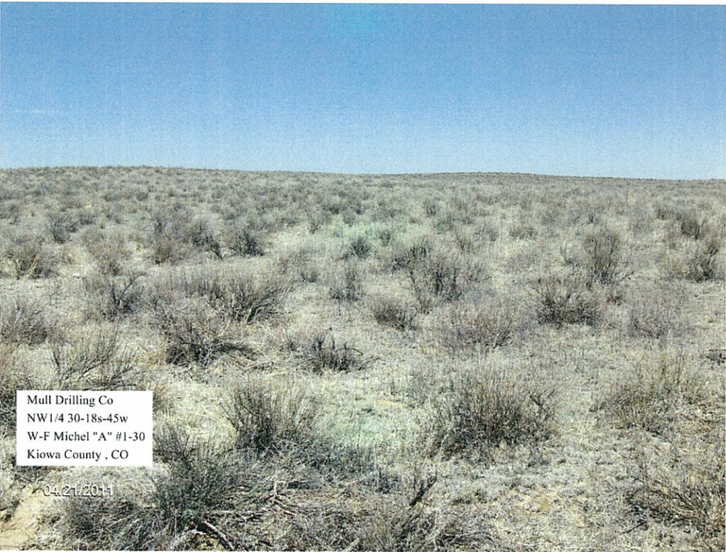
W-F Michel A #1-30 Reference Looking East

Mull Drilling Co NW1/4 30-18s-45w W-F Michel "A" #1-30 Kiowa County , CO