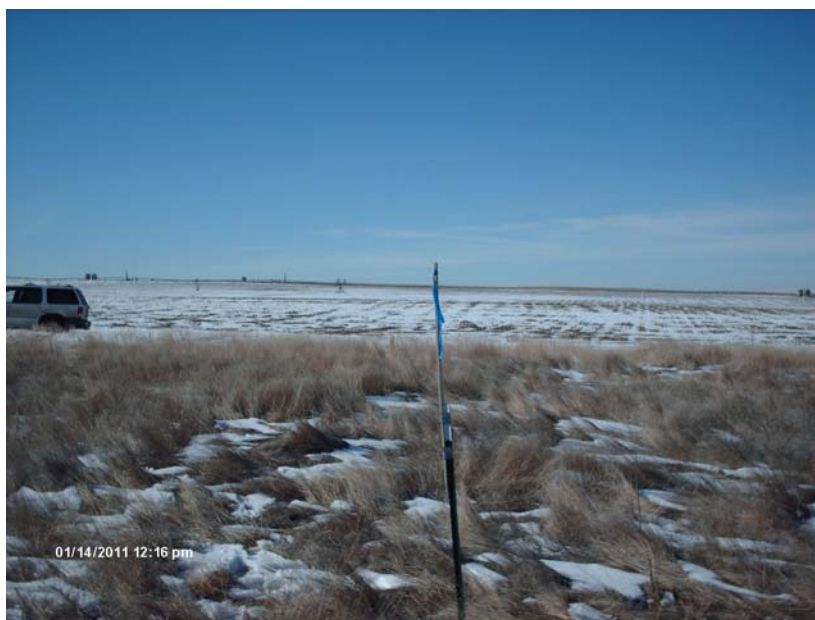
WETCO FARMS I-04 DIRECTIONAL WELL NE SW 1/4 SEC. 4 T4N R63W LOOKING WEST JANUARY 14, 2011