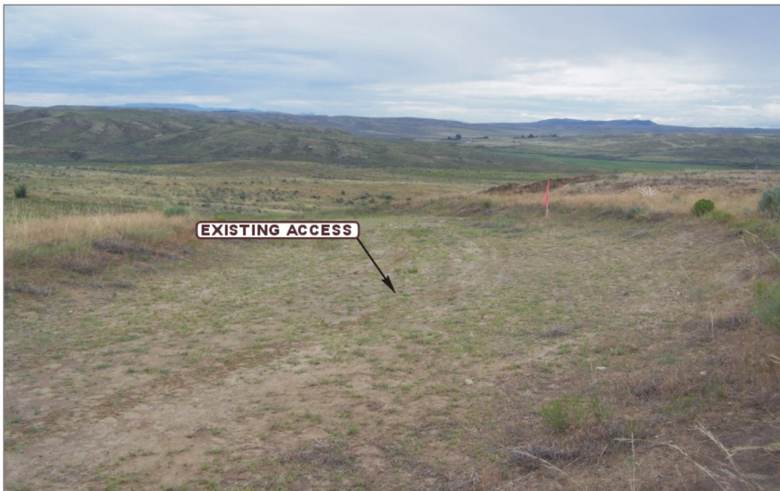
PHOTO: VIEW OF EXISTING ACCESS