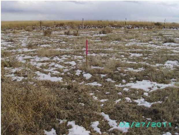
PROPOSED ACCESS AT PAD LOOKING SOUTH