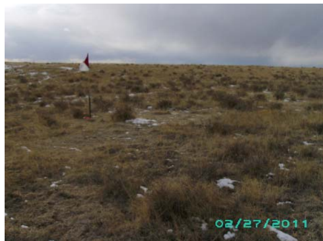
WELL LOCATION LOOKING WEST