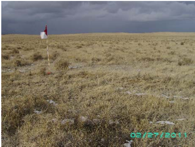
WELL LOCATION LOOKING NORTH