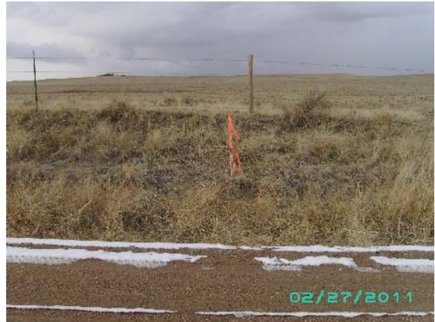
PROPOSED ACCESS TAKE-OFF AT COUNTY ROAD 106 LOOKING NORTH