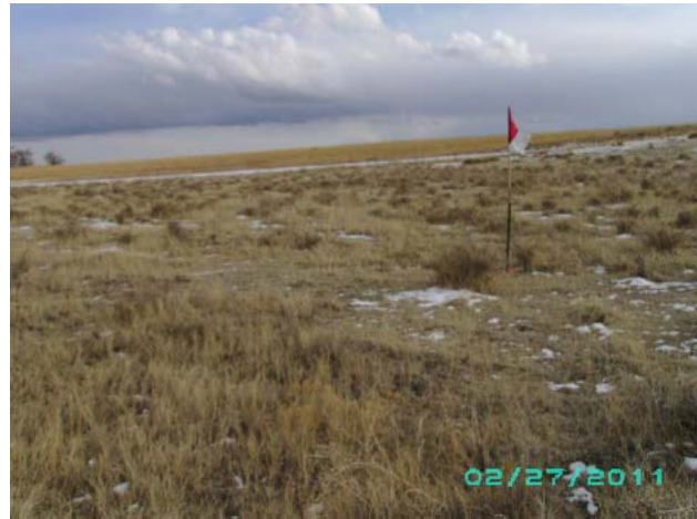
WELL LOCATION LOOKING SOUTH