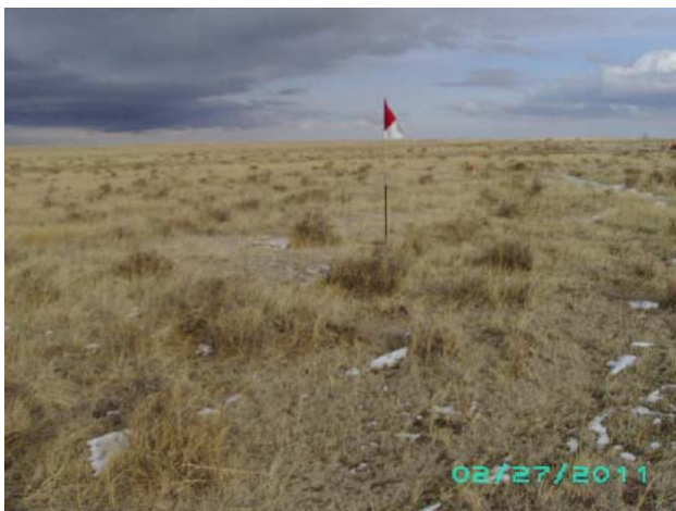
WELL LOCATION LOOKING EAST