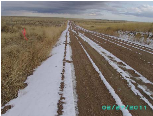
PROPOSED ACCESS TAKE-OFF AT COUNTY ROAD 106 LOOKING EAST