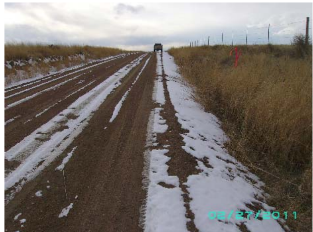
PROPOSED ACCESS TAKE-OFF AT COUNTY ROAD 106 LOOKING WEST