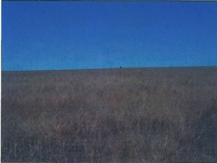
OWL CREEK 8-64-6-1A North.jpg