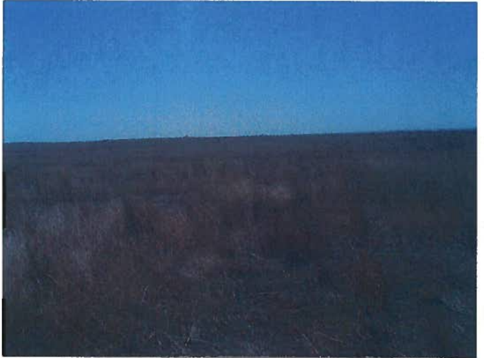
OWL CREEK 8-64-6-1A South.jpg