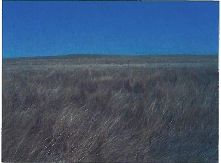
OWL CREEK 8-64-6-1A East.jpg