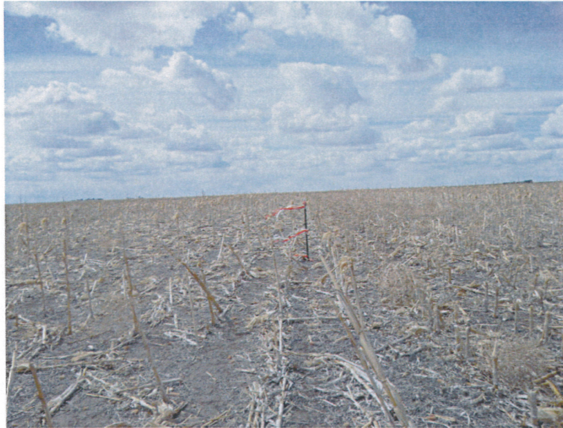
Claymon 843-6-12-L12 SW ¼ NW ¼ SEC. 6, T8N, R43W Looking West 30 March, 2011