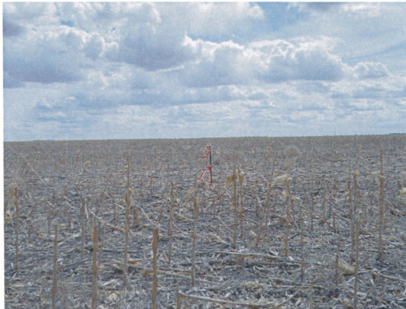
Claymon 843-6-12-L12 SW ¼ NW ¼ SEC. 6, T8N, R43W Looking South 30 March, 2011