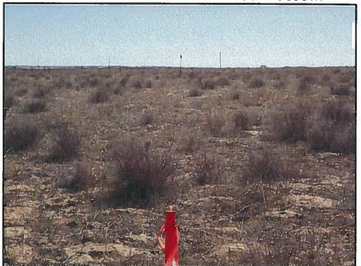
FRENCH LAKE 3-62-6-1B South.jpg