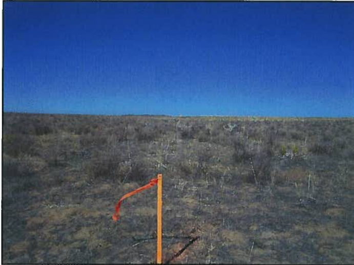
FRENCH LAKE 3-62-6-1B North.jpg