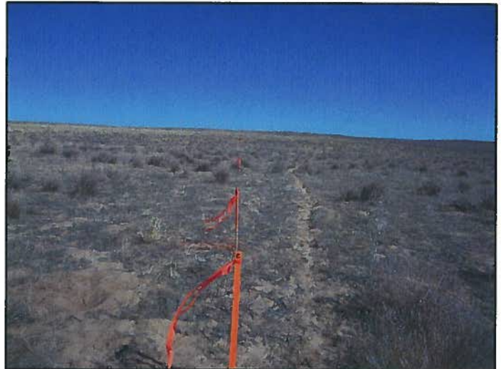
FRENCH LAKE 3-62-6-1B East.jpg