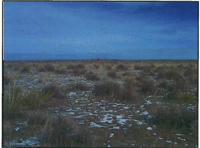
FRENCH LAKE 3-63-16-1A East.jpg