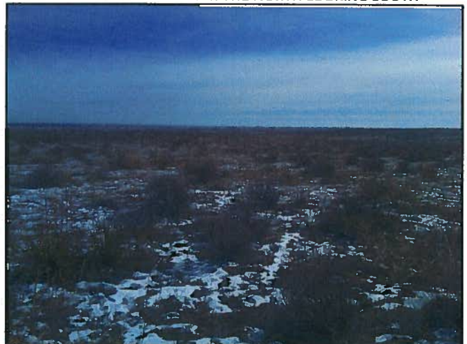
FRENCH LAKE 3-63-16-1A South.jpg