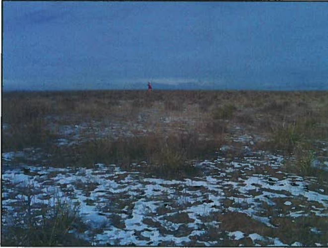
FRENCH LAKE 3-63-16-1A North.jpg