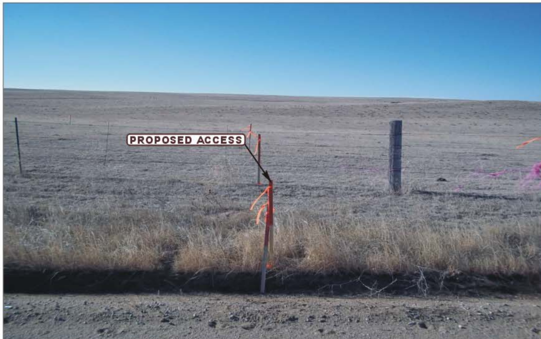
PHOTO: VIEW FROM BEGINNING OF PROPOSED ACCESS