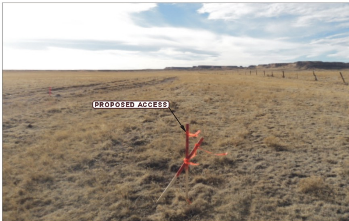
PHOTO: VIEW FROM BEGINNING OF PROPOSED ACCESS