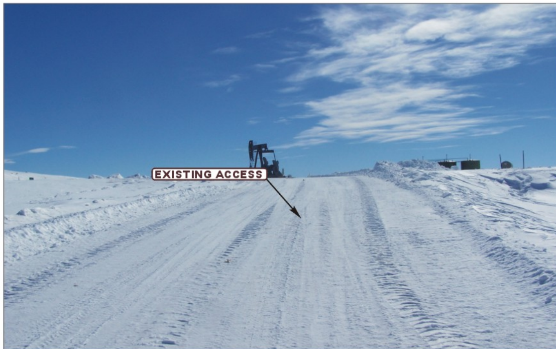
PHOTO: VIEW FROM EXISTING ACCESS