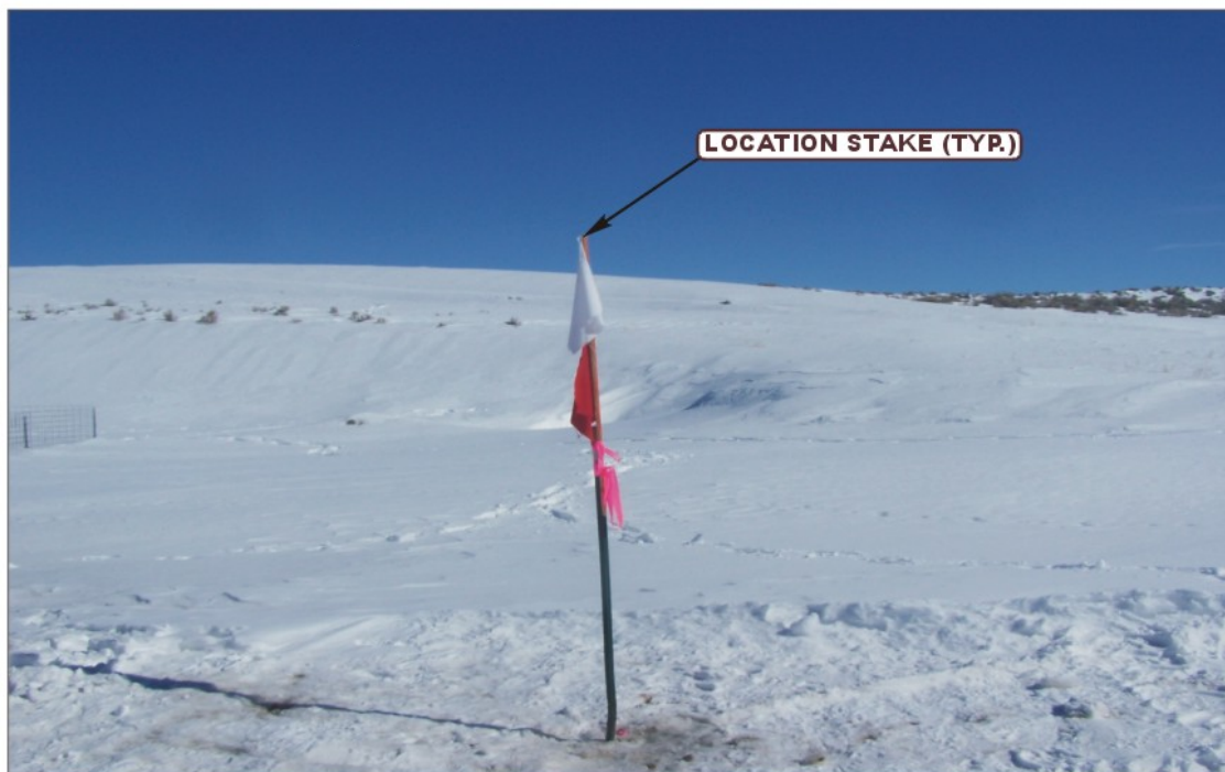
LOCATION STAKE (TYP.)