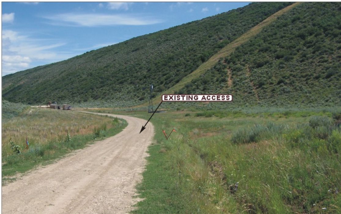
PHOTO: VIEW OF EXISTING ACCESS