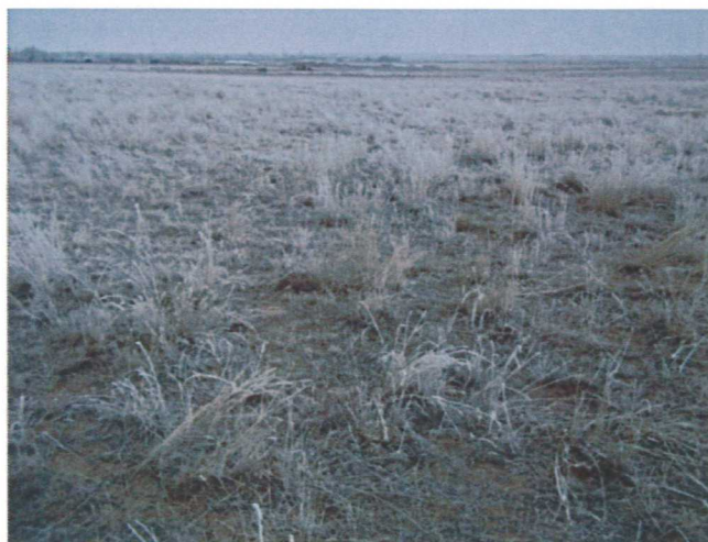
REFERENCE VIEW NORTH