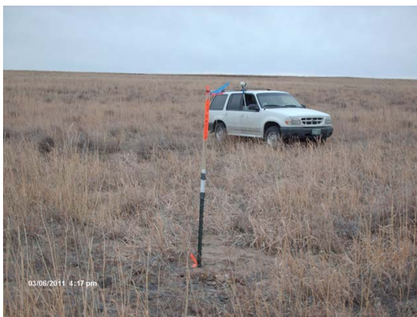
ANTELOPE 41-15 NE 1/4 NE 1/4 SEC. 15 T5N R62W LOOKING WEST MARCH 6, 2011