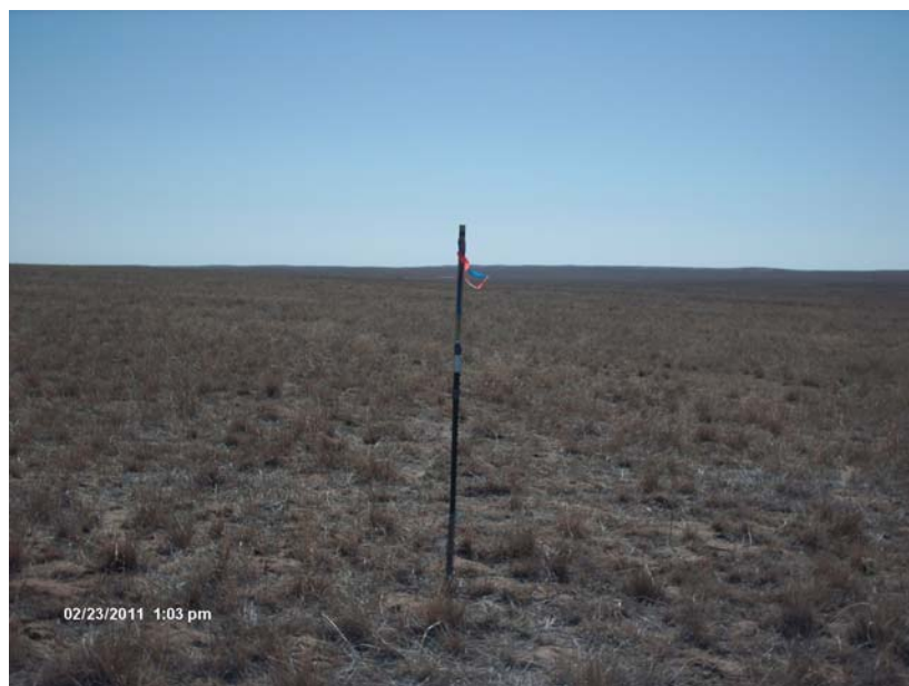
ANTELOPE 11-2 HZ NW 1/4 NW 1/4 SEC. 2 T5N R62W LOOKING SOUTH FEBRUARY 23, 2011