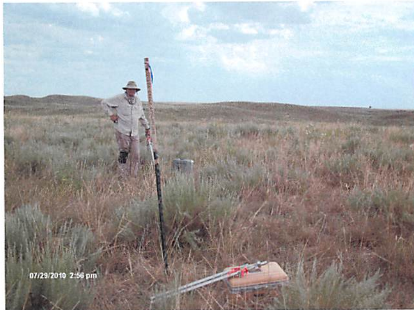
ANTELOPE 13-17 NW 1/4 SW 1/4 SEC. 17 T5N R62W Looking SOUTH JULY 29, 2010