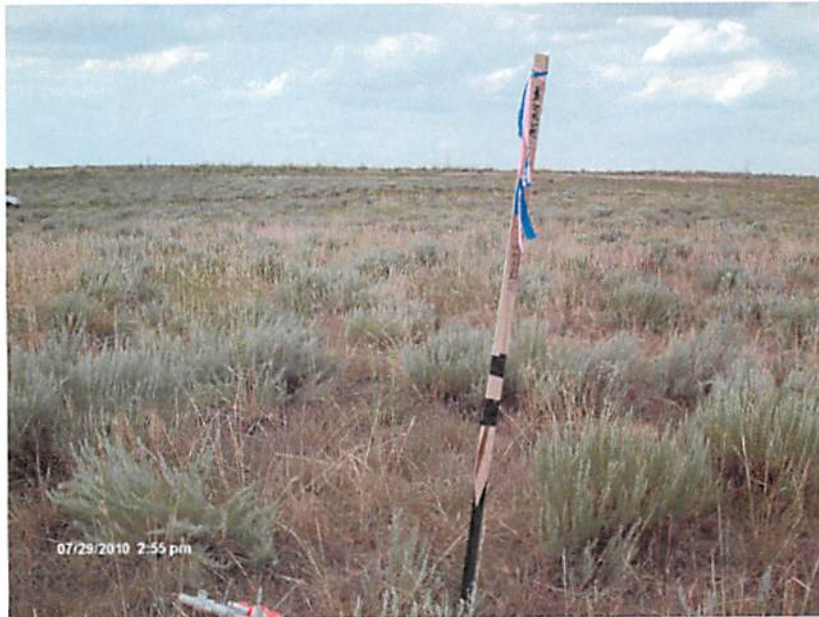
ANTELOPE 13-17 NW 1/4 SW 1/4 SEC. 17 T5N R62W Looking NORTH JULY 29, 2010