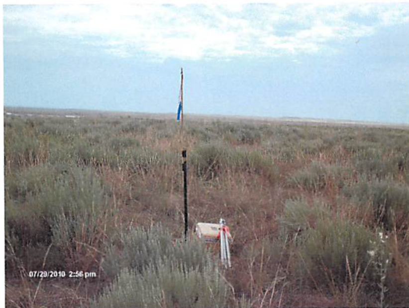
ANTELOPE 13-17 NW 1/4 SW 1/4 SEC. 17 T5N R62W Looking WEST JULY 29, 2010