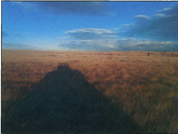
RAWHIDE FLATS 10-68-16-1B North.jpg