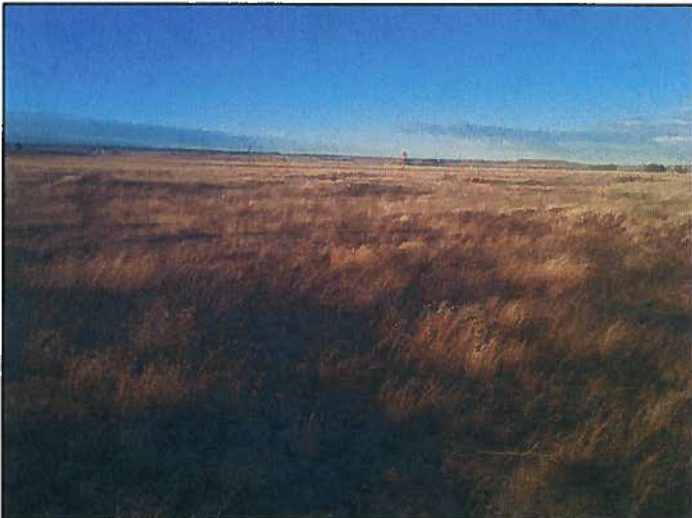
RAWHIDE FLATS 10-68-16-1B West.jpg