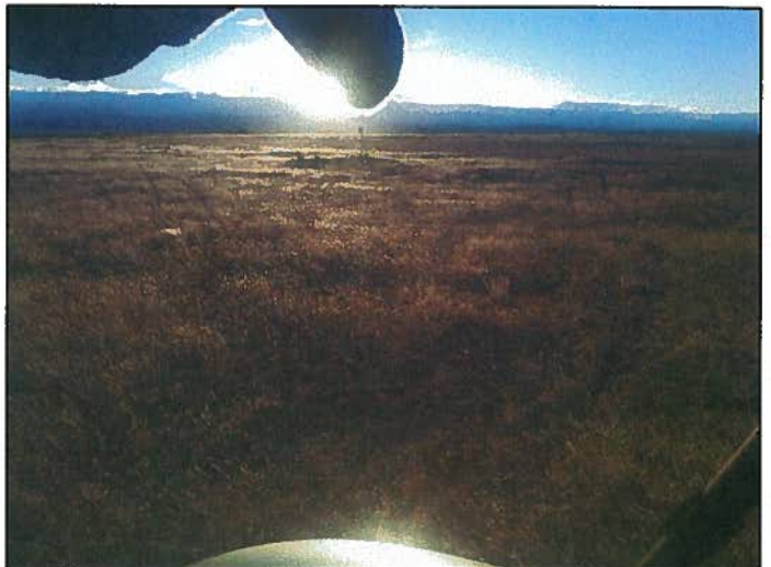
RAWHIDE FLATS 10-68-16-1B South.jpg