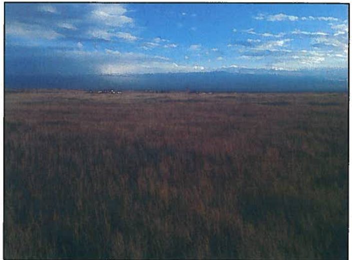
RAWHIDE FLATS 10-68-16-1B East.jpg